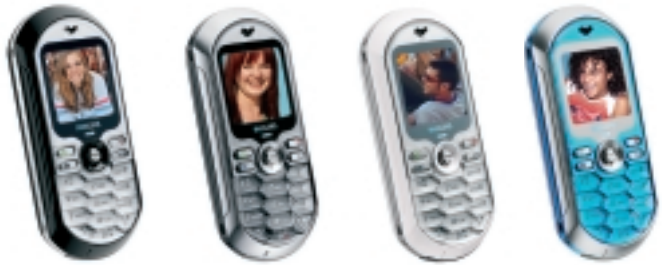
Black Forest Anthracite Volcano White Antarctic Turquoise Ocean

Wherever life takes you, whatever you do and whomever you do it with, the new Philips 355 is the perfect way to express yourself and do your thing. Shot the pictures, added a little sound and made the moment special.