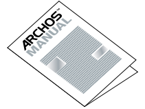
This Instruction Sheet