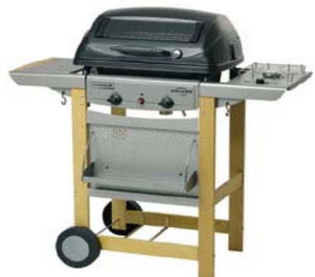
WOODY ADVANTAGE DE LUXE