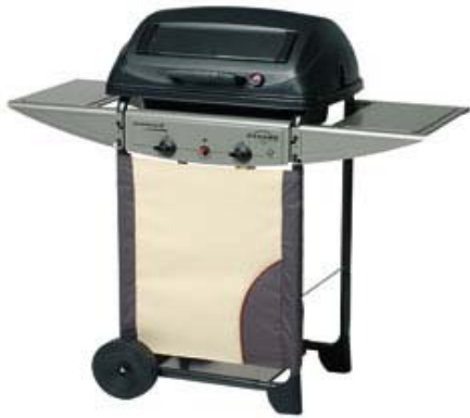
2 PLUS & SUPER