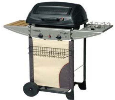
DELUXE & LUXE