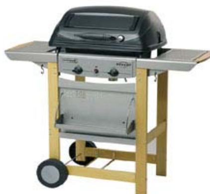
WOODY ADVANTAGE & VENTURA WOODY