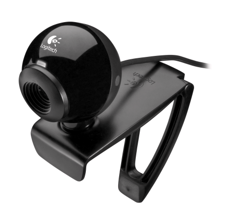
Logitech® Webcam C120